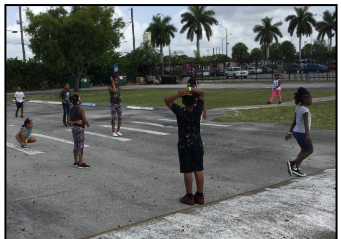
Summer Camp Outdoor Fun