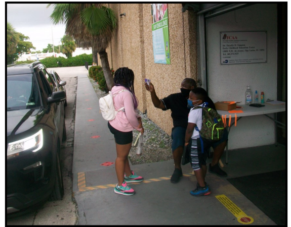
Temperature Checks Before Entering the Building