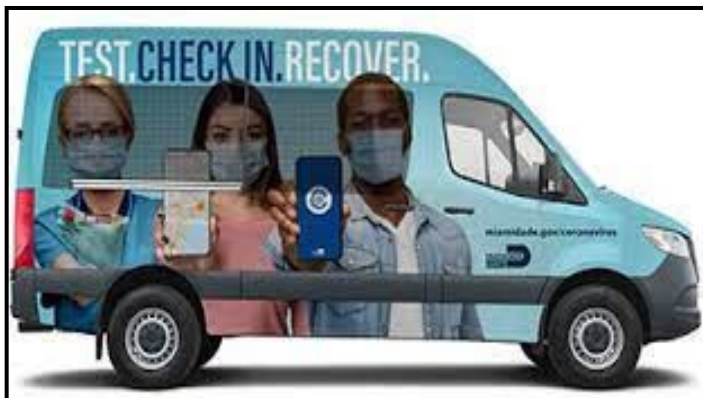
FCAA...A Mobile Testing Site