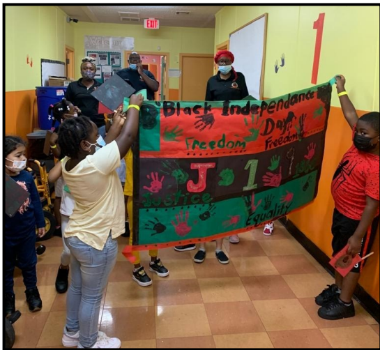
Staff and Students Celebrating Juneteenth