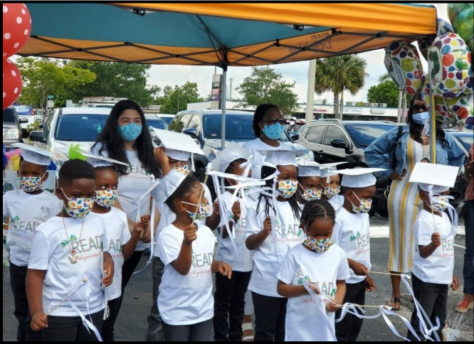
Drive Thru Head Start Graduation