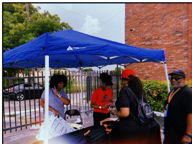
Teen Leadership Club Students Distributing Book Bags