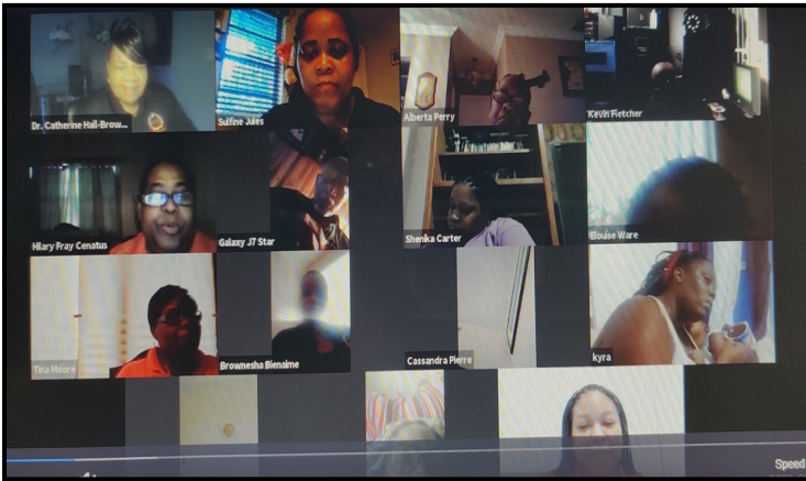
Regular Zoom Meetings