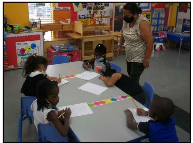
Learning with Friends