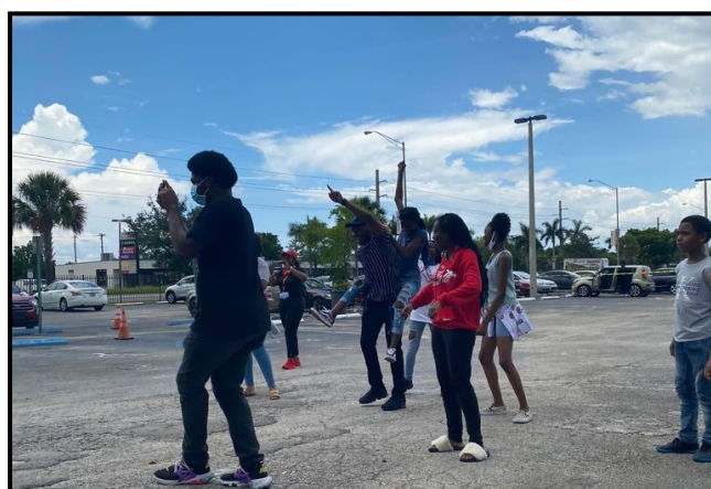
Teen Leadership Club Students Enjoying the Performers