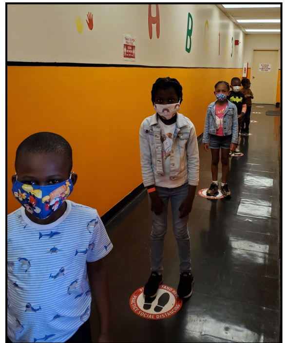
Students Practicing Social Distancing