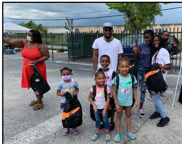
Parents and Students Receiving Free Book Bags